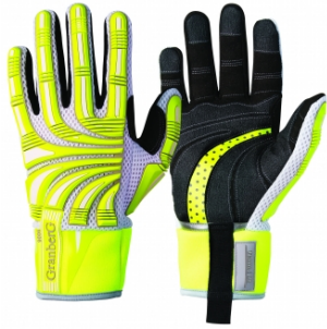
Cut D Impact Hi-Viz™ Protective Gloves, durable KR-Grip™ material in palm and fingers